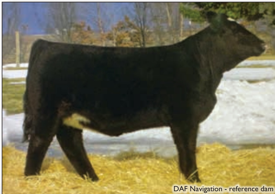
DAF Navigation - reference dam

The full sib to these eggs was last years donation lot to the National Classic that was sold through this Sale for $20,000! After the success we had with this heifer we flushed her dam to make more of these outstanding Calves and got 30 number 1's. These calves will have tons of rib and eye appeal to them and offer a very stout skeleton from top to bottom. Bid with confidence on a proven matting!