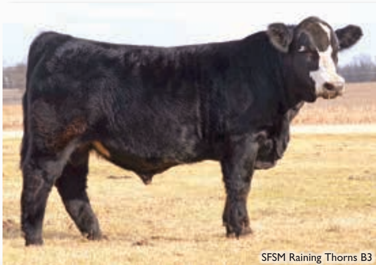
SFSM Raining Thorns B3

Think Progressive with this dark red fall bull sired by SHS Progress (2011 NAILE and 2012 NWSS Reserve Division and 2012 Illinois State fair Grand Champion) and out of NXT/SHS Eighth Wonder. Stout, powerful, thickened, big bodied and free moving describe this grand-son of WLE Glory T49 (Supreme at 2009 Royal) and FC No Wonder (2007 AJSA Classic and NAILE Junior Show Grand Champion). Good red cattle are popular and this guy certainly has the pedigree and phenotype to generate the right kind.