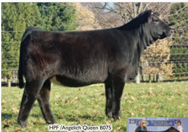
HPF /Angelich Queen B075

If all the One Eyed Jack females look like Faith B9 then it is going to fun. Here is one that we are highly fond of and just hope she finds a good home. B9 is super long necked with the ideal look desired by the most critical show person. The female is moderate in frame, deep rib with loads of guts, big hipped and sound structured. B9 is homozygous polled and is ready to show. This One Jack female puts it all together. The Jokers Faith cow family has done a great job for Lazy H, Rolling Hills and her Trademark daughter continues to excel for our small program as well.