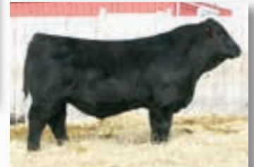
GW-WBF Substance - reference sire