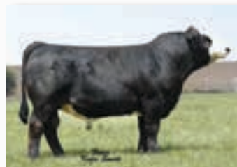
Eby/ADKS 5B Deacon - reference sire

10 Units Remington Lock N Load 54U X CNS Black Star T702 ASA# 2764838