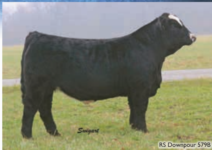
RS Downpour 579B

By the K-Ler Make It Rain bull and out of the great Hecksel donor, HSF Victoria, this young herd bull provides a rare opportunity for a Legacy free lineage without sacrificing calving ease and quality. Talk about a stout made, wide built bull, RS Downpour does that and more with his long, shapely top and eye catching profile, rear view, and baldy face! I liked this calf day one and he has just never failed to impress any of our visitors on his shear mass, his thick base coat of hair, his look, his balance, and his eye appeal. Consider collecting some semen on this bull because your neighbors will like him too!