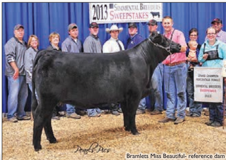
Bramlets Miss Beautiful- reference dam

Miss Beautiful has brought us nothing but success since she won the Open percentage show at the Simmental Breeder Sweepstakes in 2013. In 2014 her eggs were one of the high selling lots in Sweepstakes sale. The calves out of this mating will make you money and get you to the back drop without a doubt. Miss Beautiful averages 22 eggs per flush so fertility on these calves would not be worry in our mind!