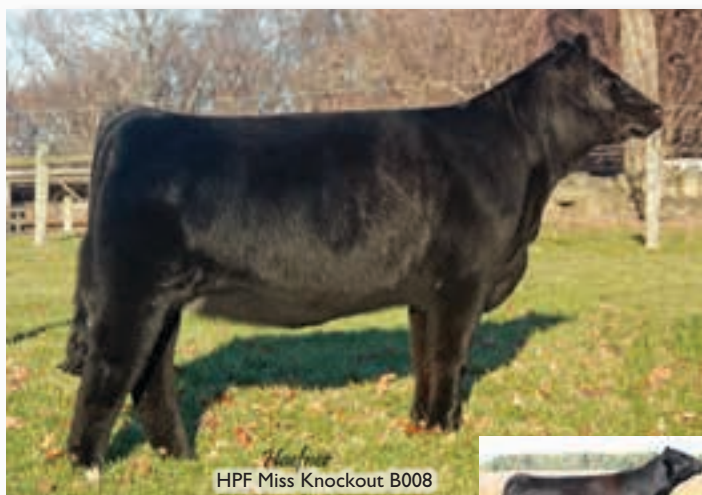
HPF Miss Knockout B008

It's not everyday you have the opportunity to acquire a direct daughter of the legendary Miss Knockout 74T. To date, eighteen heifer calves have sold thru public auction and averaged over $25,000 per head! They haven't just sold well, but they have backed up the hip by going on to win multiple National shows and become cornerstone donors themselves in some of the most respected Simmental programs in the country. B008 has all the pieces to do the same, with an out-cross pedigree and a no-miss cow family to ensure her breeding value will only escalate.