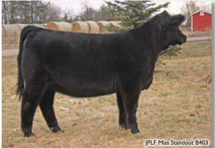
JPLF Miss Standout B403