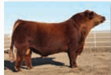
Mack AF W273- reference sire