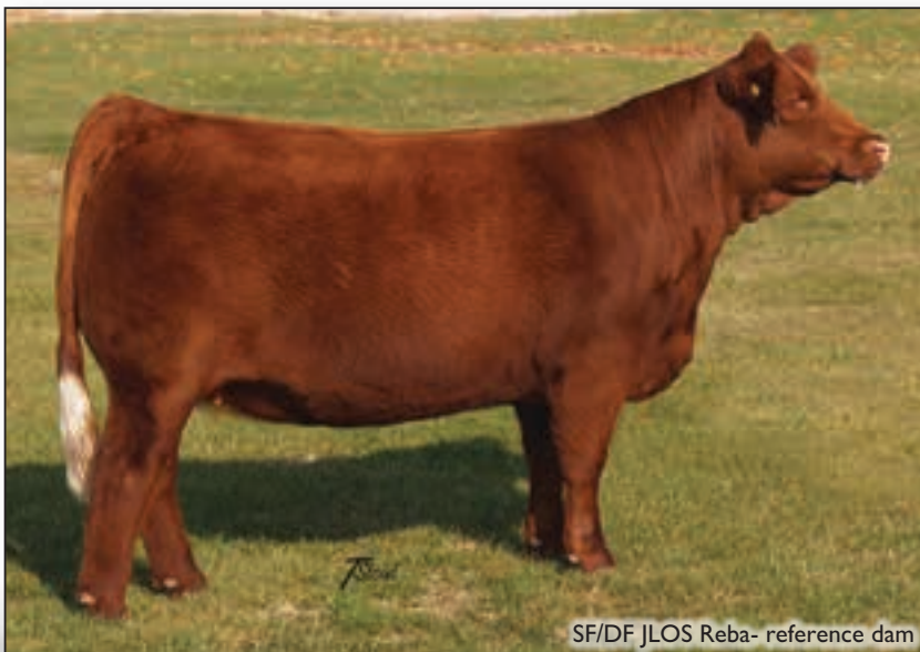
SF/DF JLOS Reba- reference dam