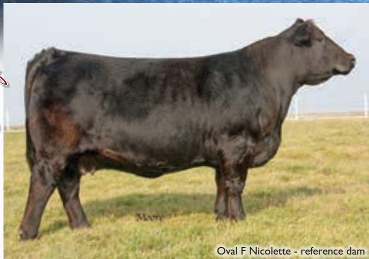
Oval F Nicolette - reference dam