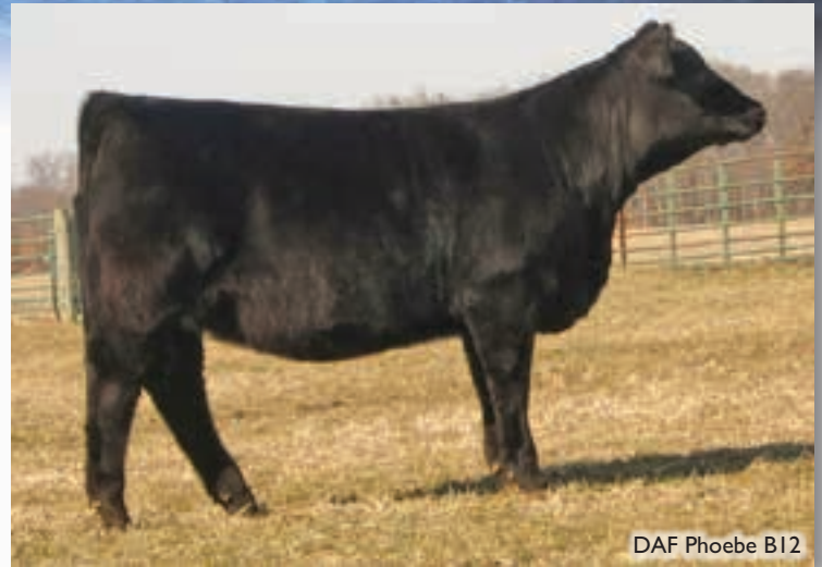
DAF Phoebe B12

Here's one that's super attractive. You'll love her front 1/3, her length and extension and squareness of hip. This 3/4 blood heads up daughter represents a long line of progeny created by a really nice uddered joker daughter. She's a great haired female with tons of future in the show ring.