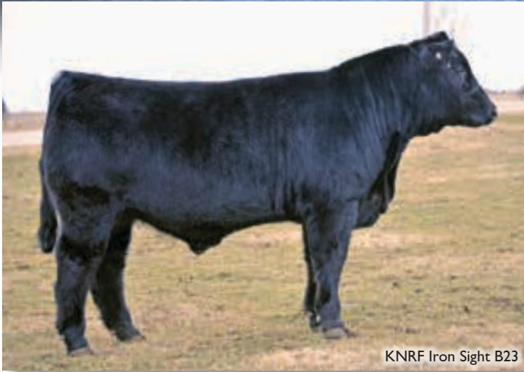
KNRF Iron Sight B23