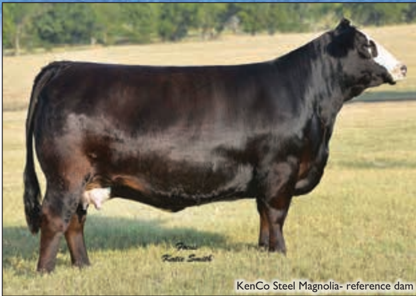
KenCo Steel Magnolia- reference dam