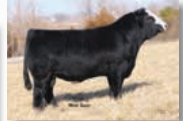
FBF1 Combustible - reference sire