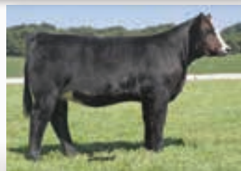
Daughter of Beauty Ms Right - reference