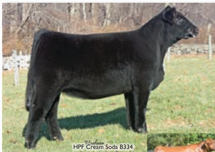
HPF Cream Soda B334

In the last several Living Legacy sales, the Cream Soda family has definitely been one of the more popular cow families we offer, and producing females like B334 would be why. Big legged, square hipped, long necked and Hairy.... B334 is one of our favorites. This female didn't enjoy picture time all that much but she better get used to it because we believe she will need to pose for quite a few more of them down the road. The Uprising's have created quite a buzz in the industry with their style, look, mass and overall presence and B334 sure does fit the bill.