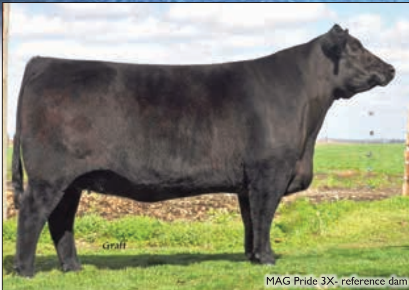
MAG Pride 3X- reference dam