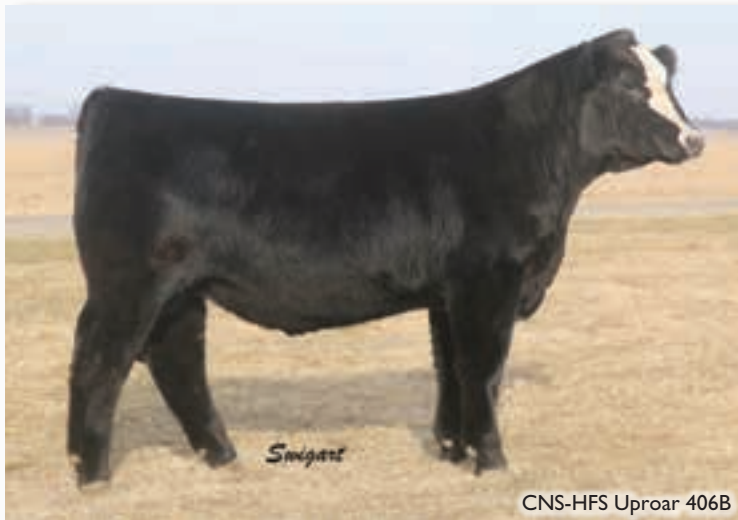
CNS-HFS Uproar 406B

With a sire that needs no introduction to the Simmental industry and a dam that has done nothing but great things for our operation, this young herd sire put it all together. A maternal brother sold in the 2013 Mid American Simmental for $4,800, B23 offers all the same traits. He offers a great look from the side and offers a tremendous amount of length in the front 1/3, and is very good in the middle. Structurally it's hard to make any better, as he is angler in the shoulder, correct in the hip, and travels with ease when on the move.