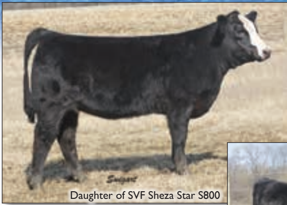
Daughter of SVF Sheza Star S800