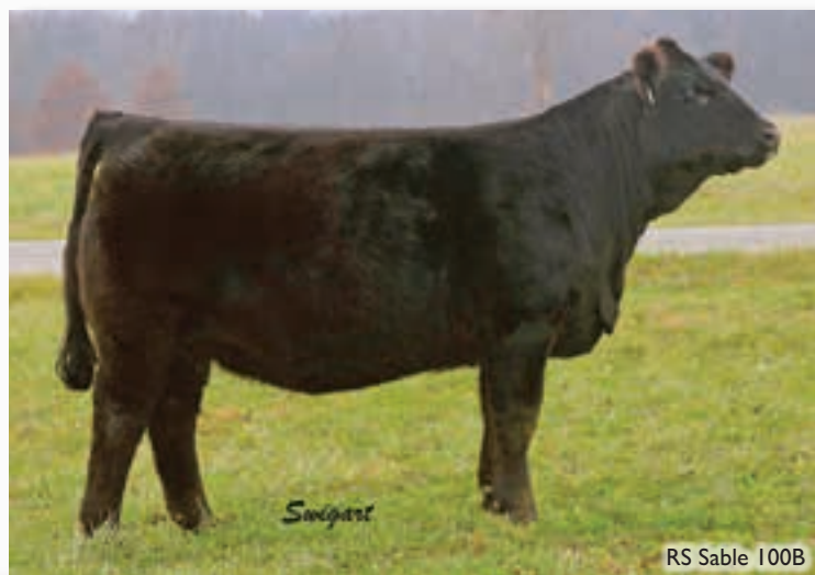
RS Sable 100B

It's nice when the younger heifers will compete and this one most certainly will. While I have to admit we mated this one with a strong push on her numbers coming from this particular cow family and yet even with her high set of EPDs in every column as well as top 5 percentile in her dollar indexes, Sable managed to compliment her genetic value with a solid phenotype. Big bodied, thick topped, strong hiped, sound structured, quiet disposition, and a lot of bloom will all come to mind when you see her! This one, no doubt, will be fun in that purebred April class and the extra bonus is that she has a great sire and dam behind her.