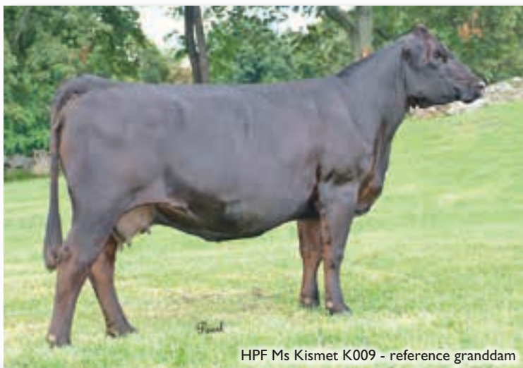
HPF Ms Kismet K009 - reference granddam

This star headed Shock Force daughter is the kind we like to produce. Sappy middle, easy doing, and extremely good structured. Females made like this are guaranteed money makers in today's business. Queen Sazerac and Queen of Hearts have produce time and time again and B075 offers both of them to you in a phenotypically attractive and balanced package.