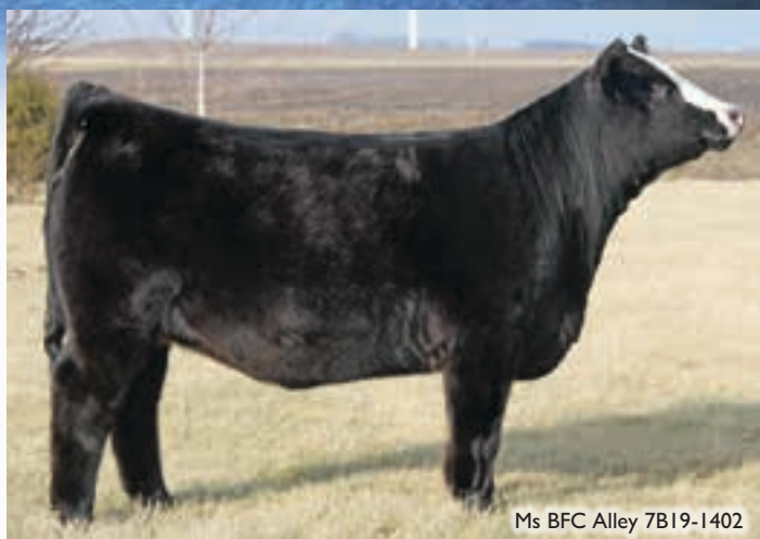
Ms BFC Alley 7B19-1402

This is a outstanding Combustible baldy female. Huge body, big footed, great haired. This heifer has it all. We will be retaining the right to one flush at Buyers convenience and a sellers expense. Check us out on facebook for more video's and pictures.