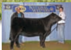
HPF Ms Queen UI84 - reference dam