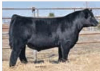
W/C No Remorse - reference sire

5 Units 3C W/C Right Track W9462 X Miss Werning 694S ASA# 2588250