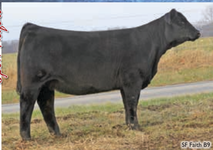
SF Faith B9