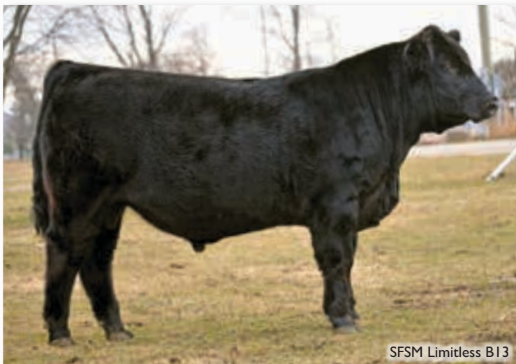
SFMS Limitless B13

When we go through and sort bulls to sell there are a few things we keep in mind. That the bull is efficient and practical. B13 fits all the criteria someone is looking for in a herd bull. He is a massive built easy doing bull that will inject a tremendous amount of growth and style into any herd.