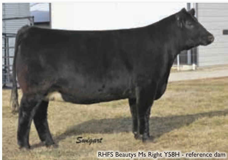
RHFS Beautys Ms Right Y58H - reference dam