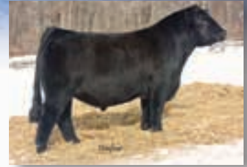
RGRS SRC Two Step 20Z - reference sire