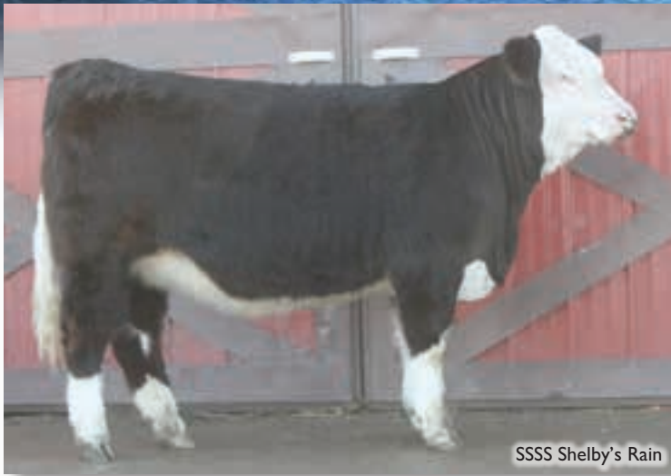
SSSS Shelby's Rain