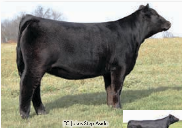
FC Jokes Step Aside