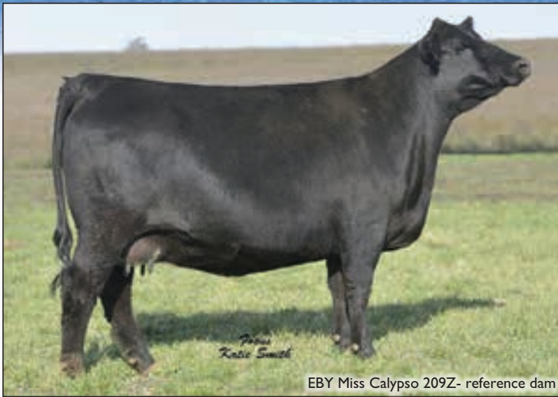
Eby Miss Calypso 209Z- reference dam