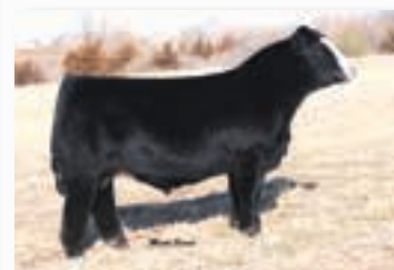
LLSF Uprising - reference sire