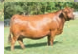
IC Cream Soda R56 - reference dam