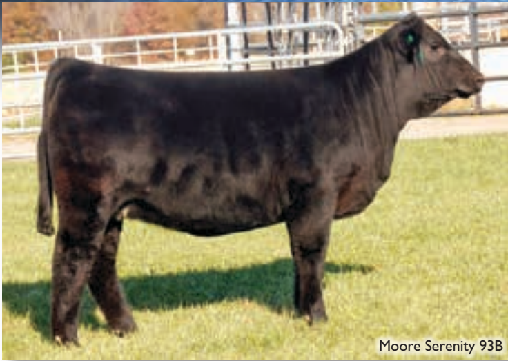
Moore Serenity 93B