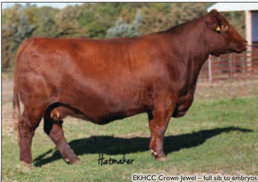
EKHCC Crown Jewel - full sib to embryos

Everyone knows a great way to acquire elite genetics is to invest in frozen embryos. This is one of those good opportunities. Sloup Simmentals was a good supporter of the past AJSA Jr Nationals and donated a flush on Red Jewell and you know the results. Sloup Simmentals is offering three sexed heifer embryos out of Crown Jewel the dam of the $46,000 Red Jewell which now resides as lead donor for Hilltop Simmentals. Red Jewell is one of the most admired red Built Right donors in the breed. The winner bidder will have some awesome full sibs. Again, sexed heifer embryos.