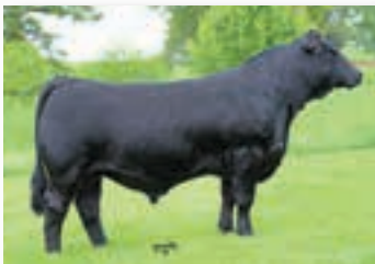
TNGL Grand Fortune - reference sire