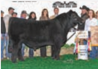
HPF Quantum Leap - reference sire