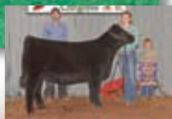
Half sister - reference