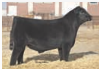
Silveras Style 9303 - reference sire