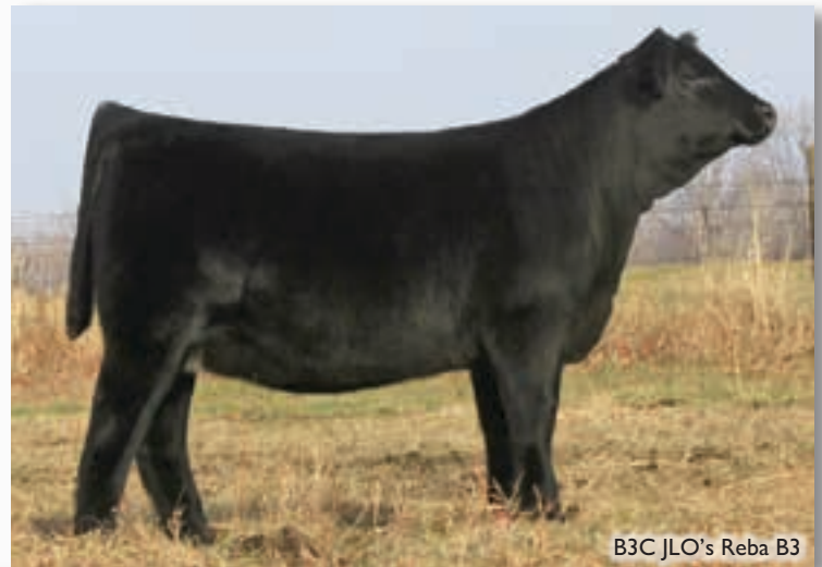
B3C JLO's Reba B3

Here is a full sib to our 25,500 heifer that sold in Louisville this past fall to Janssen Farms. B3 is a moderate framed female who's extremely complete from head to toe. She's got a ton of rib shape and she is very deep in her flank up through her fore rib. Her cow family has been really successful last couple of years and there will be lots more to come. She would be a great addition to anyone's cowherd.