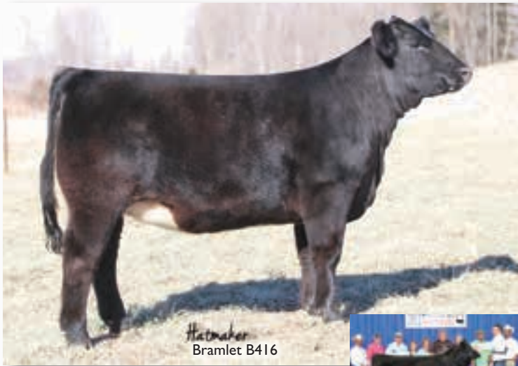
Hatmaker Bramlet B416

SSSS Shelby's Rain capitalizes on the top Simmental bloodlines in the business. She has a big white face, kid broke, great disposition. Shelby's Rain has cow maker written all over her.