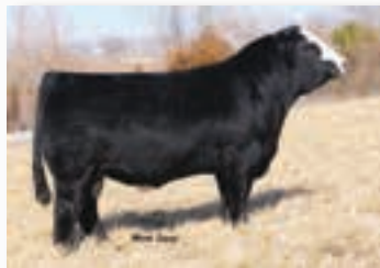
FBF1 Combustible - reference sire