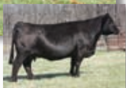
TAMU Sheza Dream Lady- reference dam