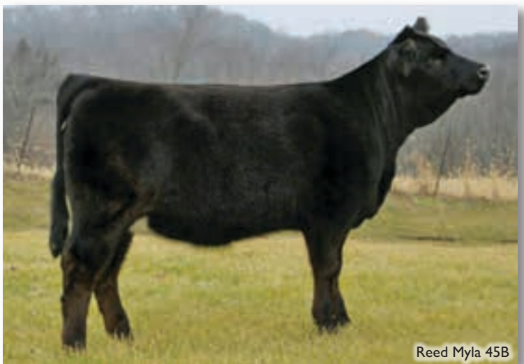
Reed Myla 45B

This young, deep made, June heifer has all of the rib shape, soundness of structure, and is really nice haired to make a competitive show heifer and then a very productive cow. Her sire, Ford, sired the division 2 champion purebred heifer in the 2014 Illinois State Fair Junior Show and also the Reserve Land of Lincoln steer.