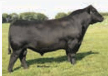
PVF All Payday 729 - reference sire