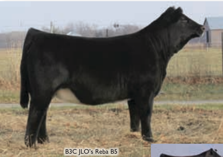
B3C JLO's Reba B5