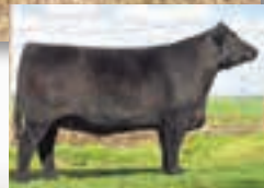
MAG Pride 3X - reference dam

Full Force is a Steel Force son out of one of the rising Angus cows in the SimAngus breed. 3X has produced several very excellent show heifers in her very young career. A full sister to Full Force was a class winner at the 2014 NAILE Junior Heifer Show. With a blaze face you can see him coming across a pasture. Moderate made, deep sided, with a big level top, but still structurally correct in his makeup. Full Force will make a difference in the herd of any type of producer. Lots of cow power, performance, and he still has the show ring look.