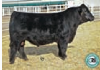
WS All Around Z35 - reference sire

5 Units GW Premium Beef 021TS X GW Miss Maternal 558P ASA# 2605922