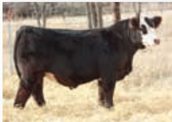
W/C Bullseye 3046A - reference sire