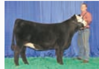
Full sib to embryos selling