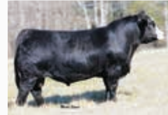
SVF Allegiance - reference sire