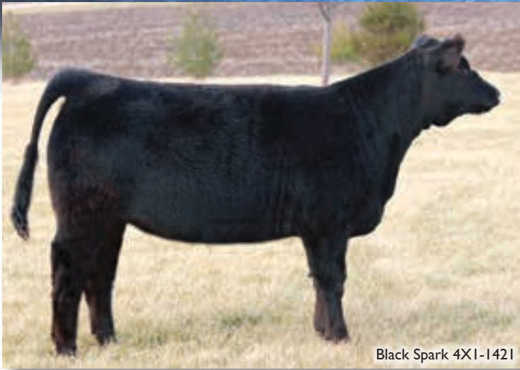
Black Spark 4X1-1421