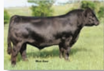
Yardley High Regard - reference sire