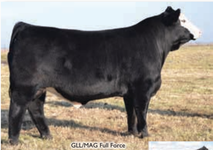
GLL/MAG Full Force

Uproar is a maternal brother to the great Pays to Dream bull. Both those bulls stem from a great factory, the K336 cow. At 14 years of age she is the cow all should compare to, ideal structure, excellent fertility, and quiet disposition. The Uprising bull has quickly gained popularity siring cattle that have the added look and presence we desire. The Uproar bull will turn heads. He's a stout featured bull with big rib shape and a very quiet disposition. Schick Cattle Company does retain a 1/3 semen interest in Uproar. The buyer is purchasing full possession and 2/3 semen interest