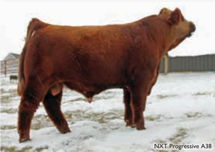
NXT Progressive A38

Mighty Max is big topped, big butted, sound traveling herd sire prospect. He holds many wins under his belt including 2014 Illinois State fair Intermediate Bull Calf Champion and 2013 Illinois State Fair Reserve Grand Champion Cow/Calf Pair.