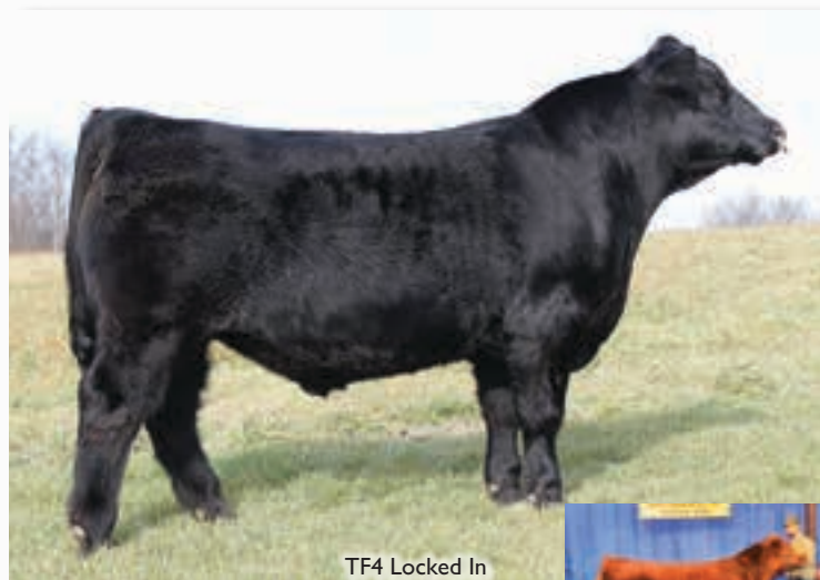
TF4 Locked In

No doubt this one carries on the BC Lookout tradition with lots of potential. Here's a sleek fronted, long bodied, deep sided bull with lots of bone. With the EPDs this one packs he will make an exceptional herd bull.