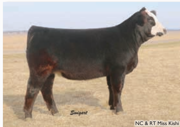
NC & RT Miss Kishi

This baldy heifer shocks you from behind with all the power, yet still has plenty of middle. All in a sound package with even better kid friendly personality. This is one that sure would be hard to part with, if we were still showing.