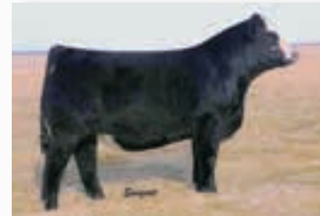
RS Braveheart son of Dixie Erica