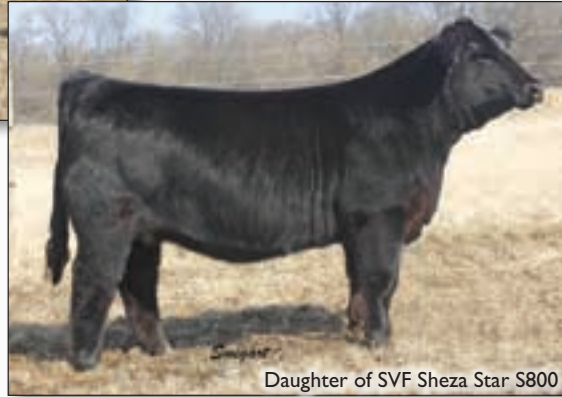
Daughter of SVF Sheza Star S800