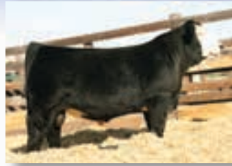
TLLC One Eyed Jack - reference sire

5 Units Long's Shear Pleasure X Long's Miss Sweet Treat ASA# 2668223