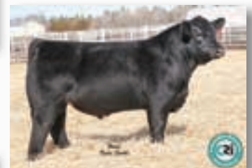
W/C Wide Track - reference sire