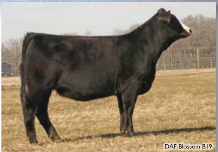
DAF Blossom B19

Here's one that's hard to fault. She's got a great head and neck, propelled out the top side of her ideally constructed shoulder. She has plenty of center body and mass and really comes together when set in motion. Her sire, X48, is out of the great Summertime donor and is a full sib to some great females that we've sold through our female sale for $13,000 and $9,000. Her bottom side traces back to T47, who sold last fall at the Black Label sale in Texas for $10,000 at nine years of age. There's lots of revenue generating potential here for lots of years following a fun show career.