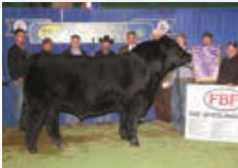
FBFS Wheelman 649W - reference sire