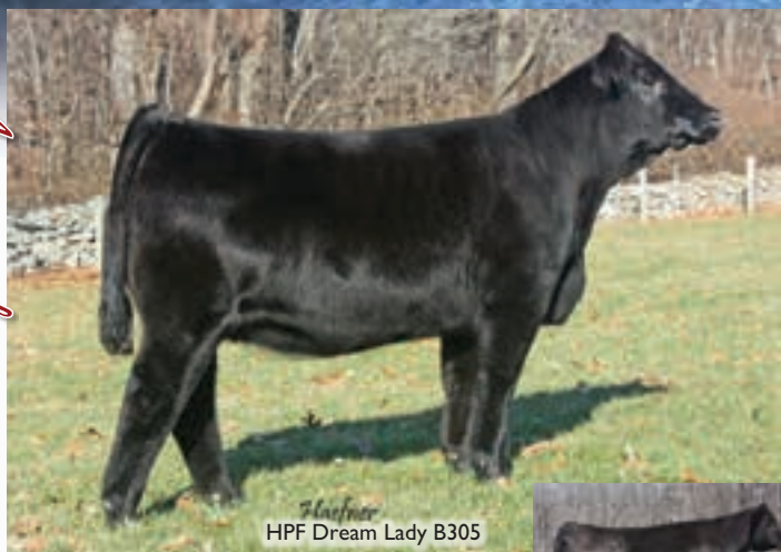
HPF Dream Lady B305