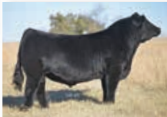
LLSF Pays to Believe - reference sire