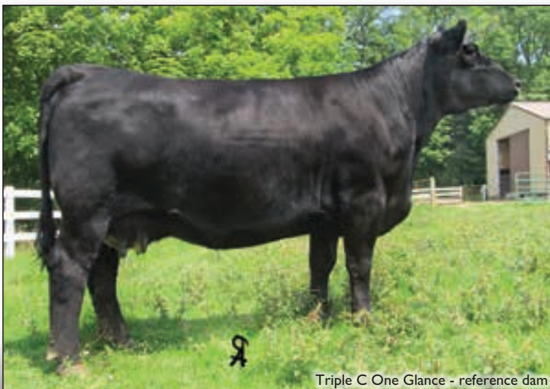
Triple C One Glance - reference dam

Selling 3 embryos guaranteeing 1 pregnancy or 5 embryos guaranteeing 2 pregnancies if work is performed by a certified embryologist. Mack made his debut din Denver in 2012 where we found out he was definitely named appropriately. Mack was simply named after a truck. His semen was limited and now his time has come again to offer his genetics to the public. With the impressive offspring that were in Denver this year, the future of this proven sire is tremendous. From the black baldies to the solid black and reds, they are simply amazing in their structural design and overall body dimension while still retaining the killer profile that everyone strives for. Mack has a must see video on you tube at Mack AF W273.