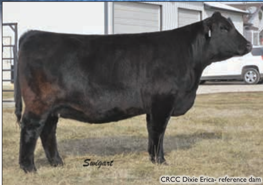
CRCC Dixie Erica- reference dam