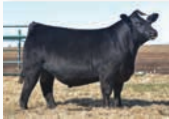
Sandeen Upper Class - reference sire