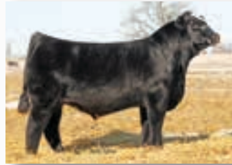
FBF1/SF Ignition - reference sire

5 Units SVF Steel Force S701 X Lazy H Burn Baby Burn R34 ASA# 2588018