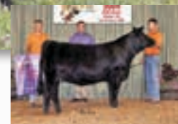
DAF Reba U16 - reference dam