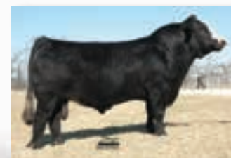
SVF NJC Built Right - reference sire