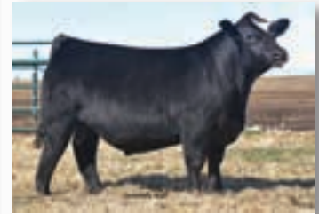
Sandeen Upper Class - reference sire