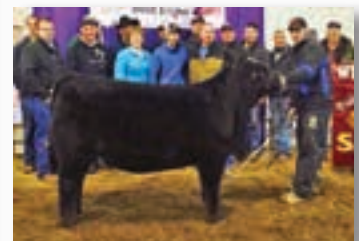
Full Sib to Embryos