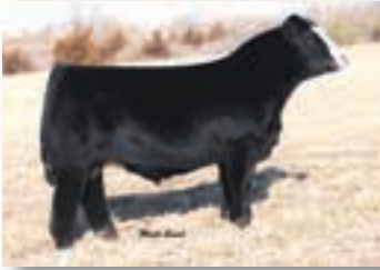
LLSF Uprising - reference sire

Shipping or pickup is responsible to the buyer. Proceeds go to the Illinois Simmental Association.