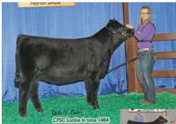
CFSC Luckie In time 14B4

She has already seen the green shavings at NAILE, placing at the top of her class. A full sister was 16th overall bred and owned at the 2012 Simmental Junior Nationals. Another full sister was first in class at Eastern Regionals in 2013. A half sister recently was division champion at the Hoosier Beef Congress in Indiana this past December as a Sim Solution. She is as sound as they come, with plenty of bone and very striking from the profile. With an API of 123, breeding possibilities are endless for the new owner.