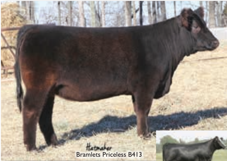
Hatmaker Bramlets Priceless B413

This is a mating where not introduction is needed. Shelby x First Class. When we acquired this valuable high demand semen there was no contention as to which donor was being flushed first. This female has it all eye appeal, length and performance. She is a combination female by being back drop competitive yet pasture productive. These Shelby daughters are powerful like their mothers with that subtle amount of style from First Class. A mating of this caliber is hard to find. Serenity is out of the highest income producing female on the farm by the now deceased First Class who's semen has reached $11,000 per unit. Truly a mating made among the stars.