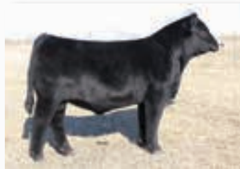
Mr TR Hammer 308A - reference sire