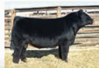
WLE Big Deal - reference sire